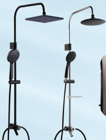
Matte Black Rain Shower